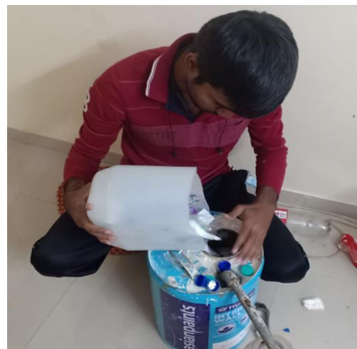
Fig. 3.9 Feeding into the reactor