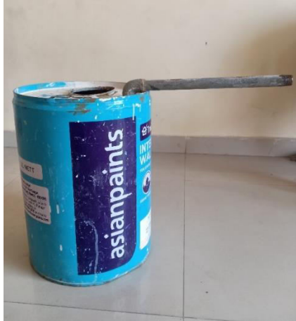
Fig. 3.4 Reactor