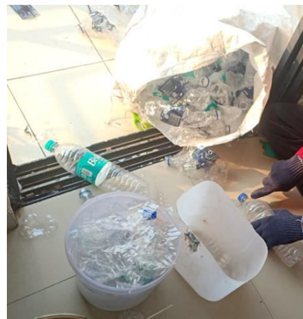
Fig. 3.7 Collection of plastic