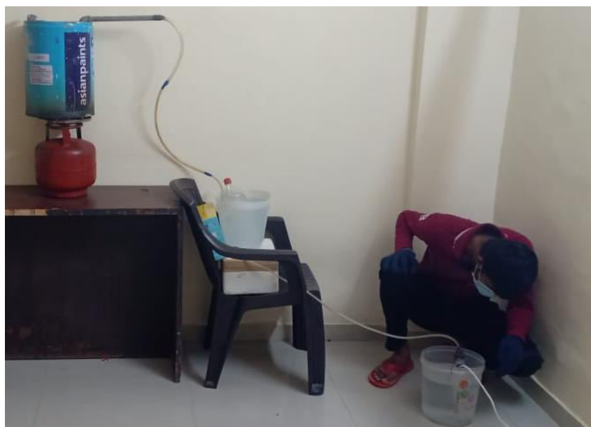
Fig. 3.3 Pyrolysis unit

Pyrolysis unit developed by using Reactor which can hold high temperature. By using arc and gas welding technology, we fabricated the above pyrolysis unit. The experiments were carried out with high temperature and atmospheric