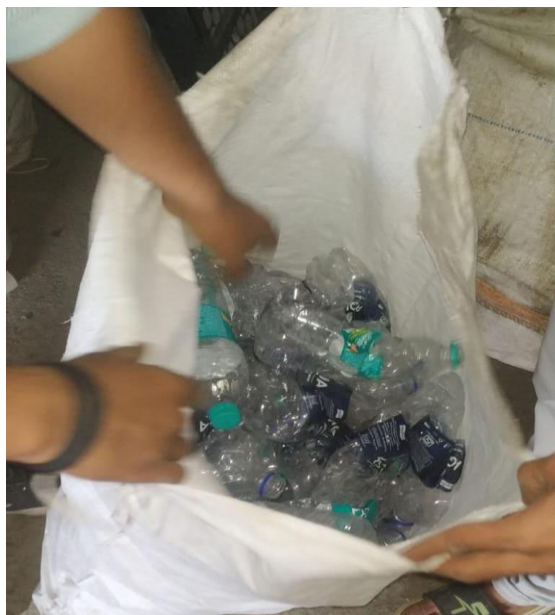
Fig.3.1 Plastic bottles