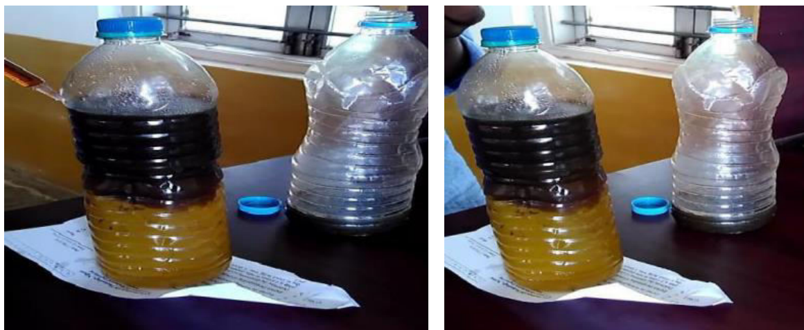
Fig. 3.10 Purification Setup

In this method, we take an equal proportion of plastic fuel and water in a container and shake it well, allowing it for 5-7 hours to settle down. Now water along with some crystals is collected at the bottom and pure plastic fuel is collected at the top container. In meantime check the pH value of plastic oil by using a pH meter if it is acidic in nature it is needed to many times wash with water to bring the pH of oil to 7.