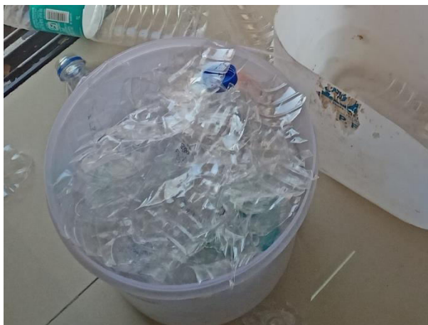
Fig. 3.8 Grinding of plastic