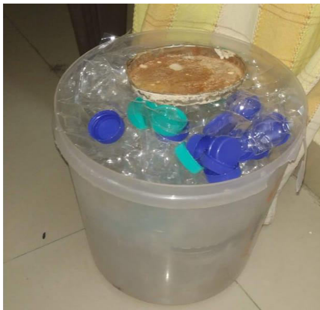
Fig. 3.2 Grinded plastic waste

The above Figure.3.1 and Fig 3.2 shows the plastic bottle wastes and grinding of plastic bottle waste respectively, these are used as feedstocks to produce liquid fuel compounds. Plastic covers and edible oil covers are selectively collected from local hotels and hostels.