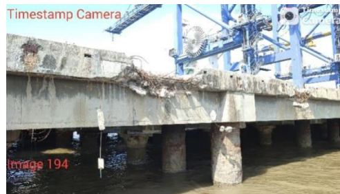
Fig 1.5 Damaged side walk

Small pores may lead to severe cracks and corrosion of the steel in the concrete as water percolates through. Which in turn provides better environment to the corrosion of steel. It is evidenced from site that there may be presence of percolating water up to the steel which is corroding steel resulting in increase in volume of steel and causing bulging of concrete in fig 1.6.