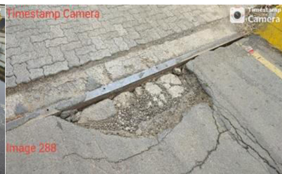
Fig 1.4 Damaged expansion joint

Sudden jerks, accidents, impact by water vehicles are also responsible for damages in the structures along with sudden and turbulent wind waves which breaks the piles or births which disturbs the stability and intactibility of the strcutre resulting in infunctionality of the strucutre. (Fig 1.7). Photograph shows the same kind of damages.