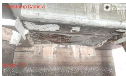
Fig 1.7 Spalling of cover-Crete

Not following IS codes, under-estimating the load, not considering load factor, etc. can contribute to the reduction in strength of the structure. Negligence during construction process can also lead to loss of strength of piles. Thus, it is very necessary to design and construction of the structure should have utmost importance.