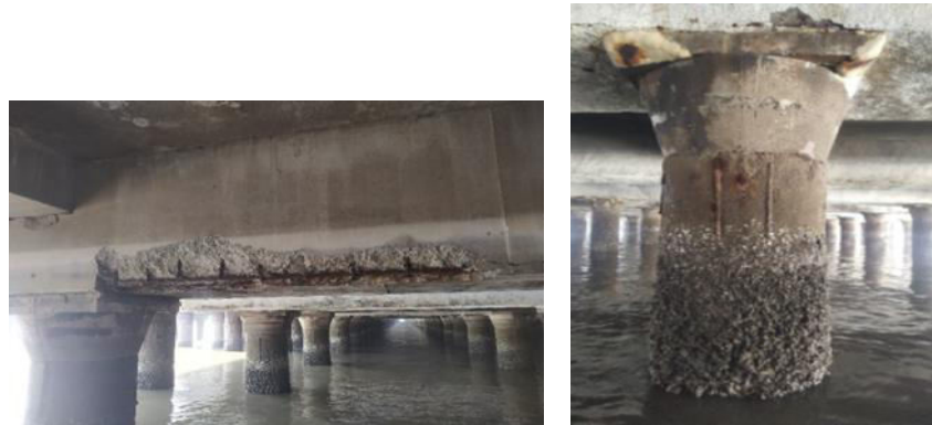
Fig 1.8 Exposure of steel 1.9 Corrosion on piles