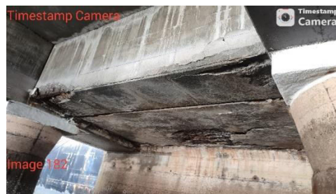
Fig 1.6 Bulging of concrete

Small pores may lead to severe cracks and corrosion of the steel in the concrete as water percolates through. Which in turn provides better environment to the corrosion of steel. It is evidenced from site that there may be presence of percolating water up to the steel which is corroding steel resulting in increase in volume of steel and causing bulging of concrete in fig 1.6.