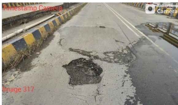
Fig 1.3 Damaged pavements

Following shows damages to the structures, which includes damages to pavement on jetty and approach trestles as shown in fig 1.3. Poor patchwork has been shown on several locations.