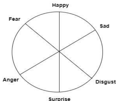
Fig 1 Dimensional model of Emotions

Dimensional Emotion model This model represents emotions focusing on three parameters: valence, arousal, and power. Valence means polarity, and arousal means excited feeling (Bakker et al. 2014). For example, Furious expresses more extreme anger. Power or dominance indicate restriction over emotion.