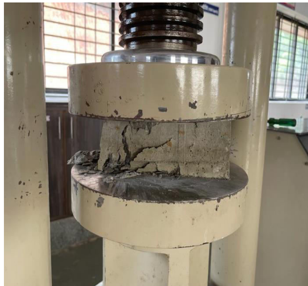
Fig.5:compressive strength testing