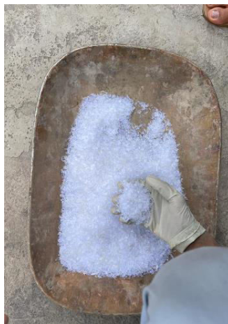
Fig.1: crushed plastic waste

Plastic waste was procured from the nearby plastic management centre. Plastic waste that were mostly collected were plastic bags, Plastic container waste, buckets, mug etc. Crushing of the plastic waste was made to make powder form.