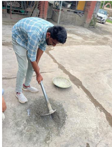
Fig.2: Handmixing of materials