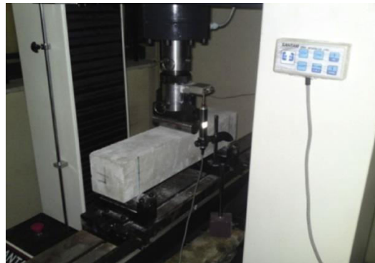
Fig. 4. Flexural strength test using “Universal Machine”.