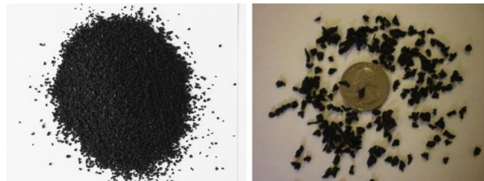
Fig. 2. Type of crumb rubber employed in this study.