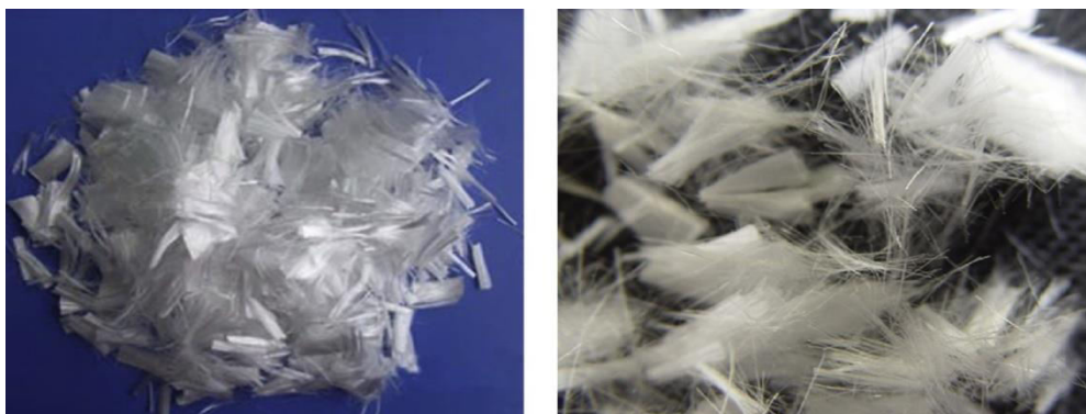
Fig. 1. Type of polypropylene employed in this study.