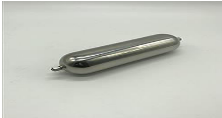
Fig :- AIR TANK