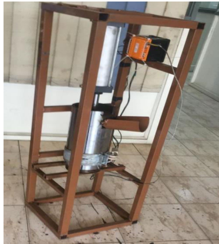
Fig 1 Functioning of a Plastic Injection Moulding Machine

In this gadget cylinders are used for plunger movement and automatic establishing of die. After the of entirety of the cycle the air movements out thru the out port of 5/2D.C. Valve. This air is launched to the environment. In future the mechanism may be evolved to use this air again for the running of cylinders.