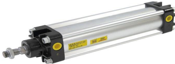
Fig: -DOUBLE ACTING CYLINDER

Double acting cylinder utilize the power of air to move in both broadens and withdraw strokes. They have two ports to permit air in, one for outstroke and one for in stroke. Twofold acting chambers apply pneumatic strain on the two sides of the cylinder on the other hand. They perform work in the two bearings of development. These chambers don't need a return spring except if a particular rest cylinder is required at whatever point the gadget isn't fueled.