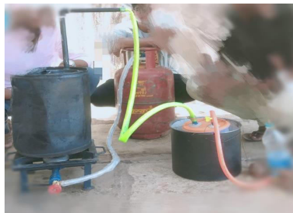
Figure 2: Experimental Setup

A laboratory scale externally heated fixed bed pyrolysis batch reactor was used for production of oil from plastic. The schematic diagram of plastic pyrolysis setup is shown in figure. Basic instruments of the pyrolysis chamber are temperature controller, condenser, a heating coil, storage tank, valve, and gas exit line. The effective length and diameter of the glass made reactor are 38 cm and 15 cm, respectively. The reactor with polythene was heated electrically up 475°C with Ni- Cr wire electric heater. Then the gases produced from heating of plastic are passed toward condenser, where condensation of these gases occur and get oil from the plastic. Mainly there are two types of plastics: thermoplastics and thermosetting plastic. If enough heat is supplied, thermoplastics can be softened and melted repeatedly. On cooling, they are hardened, so that they can be made into new plastics products. Examples are polyethylene terephthalate, polystyrene, polyvinyl chloride, high- density polyethylene, low-density polyethylene, poly propylene etc. They are recyclable. Thermosets or thermosetting plastics can be melted and shaped only once.