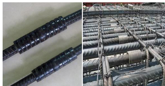
Crimping rebar coupler Threaded rebar Coupler

Rebar Coupler eliminate tedious lap calculations. Rebar Coupler are fast and easy to install and requires no specialised skilled labour. Rebar couplers are cost effective by reducing labour costs and accelerating job schedules. Dowel bar substitutes reduce labour on site, formwork costs and increase job site safety.