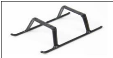
1. Landing gear