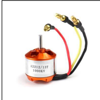
2. BLDC Motor