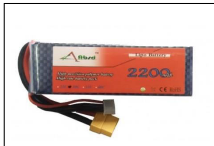
5. Lithium Polymer Battery