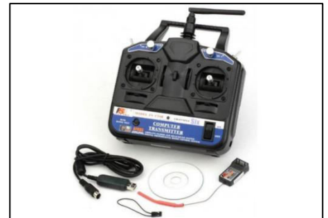
6. Transmitter and receiver