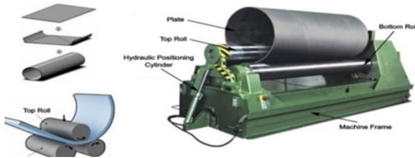
Fig. 4 Plate Rolling Machines

There are various types of plate rolling machines about which one should definitely know, in order to select the best for their usage. Scroll down to learn more: