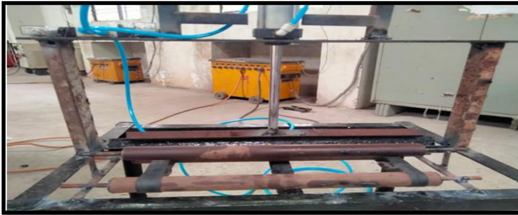
Fig. 5 construction of pneumatic sheet metal cutting machine

In our project we used components are pneumatic actuator, solenoid valve, DC motor, Directional control valve, pipe joint, pneumatic compressor etc The pneumatic sheet bending machine includes a table with support arms to hold the sheet, stops or guides to secure the sheet, upper and lower straight-edge blades, a gauging device to precise position the sheet. The table also includes the two-way directional valve. The two-way directional valve is connected to the compressor. The compressor has a piston for a movable member. The piston is connected to a crankshaft, which is in turn connected to a prime mover (electric motor, internal combustion engine) allow air to enter and exit the chamber. When the compressor is switched ON, the compressed air flows to the inlet of the pneumatic cylinder. The sheet is placed between the upper and the lower blade. The lower blade remains stationary while the upper blade is forced.