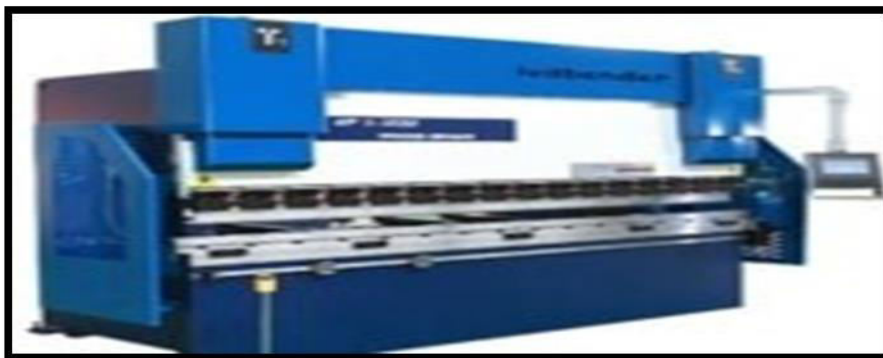
Fig. 3 CNC Press break machine

A CNC press brake is referred to as a 3-axis machine which is found to be accurate, automatic & has fast back gauge. This is known to be one of the perfect tool which is used for fulfilling the precise bending requirement. These are the ones which are known to be highly user-friendly and are found offering cost-effective solutions as per the requirement of the various industries. Each section of the machine is found to be ready in order to provide the best support while operating. These machineries are specially designed in order to fit all the precise bending requirement at a very low investment comparatively.