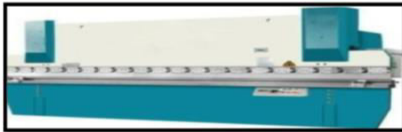
Fig. 2 Hydraulic press break machine

All the technically superior and perfectly engineered instruments are found to consume less electricity and are even found having minimum maintenance. Mostly due to the rear cylinders, the system is responsible for consuming lower pressure along with the compact cylinders. The machines with these types of superior quality are found having power to fight against fatigue failure and the machines have a capacity of better rigidity as well as load carrying capacity.