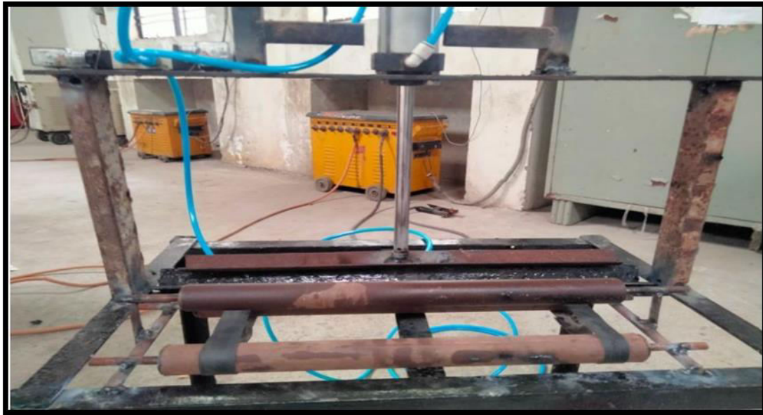
Fig. 6 Working of pneumatic sheet metal cutting machine

When from the pneumatic cylinder air taken from that with the high velocity air is flowing from the pipes. pneumatic compressor compressed the air with the high pressure and velocity. The DC motor help to provide the power supply. When air is compressed with the high pressure and the compressed pneumatic cylinder and piston go down with the high pressure of air impacted on the sheet and bend the metal sheet as per the die. The metal sheet placed properly in fixture and forming the bending shape as per the required with the help of die. Also in our product used the solenoid valve, when with the high pressure of air coming as per the given specification valve is open and piston go down and impacted on the sheet and bend. After the pressure of air is reduced the piston or cylinder goes up and closed the valve this is work with the help of two directional control valve. The function of solenoid valves all of air correct time interval. The 5/2 solenoid valve is used. In one position air enters to the cylinder and pushes the piston so that the cutting stroke is obtained. The arm from the compressor enters to the flow control valve. This is the process followed continuously for bending the metal sheet. Also in the industry for the mass production it is very useful.