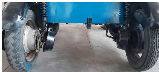
Fig. 11. Hun Motor Mounting on Rear wheels

3.Hub Motor Mounting: As the hub motor is used in the vehicle so motor mounting was itself done by mounting the Rear wheels in the vehicle. The hub motors were mounted at the Rear Axle of the vehicle.