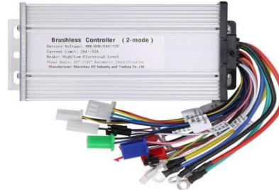
Fig. 3. Controller

5. Steering System: The steering of an electric car is very sensitive. Rack-and-pinion steering is quickly becoming the most common type of steering on cars, small trucks and SUVs. It is actually a pretty simple mechanism. A rack-and-pinion gear set is enclosed in a metal tube, with each end of the rack protruding from the tube. A rod called a tie rod, connects to each end of the rack. When you turn the steering wheel, the rod which is in constant with steering is inserted into the roller ball bearing which is fixed on chassis the tie rods at each end of the wheel bearing are connects with the rods, this rod will turn the front wheels.