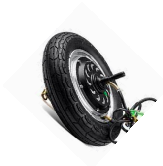
Fig. 1. Hub Motor

electric vehicles, in the 1970s, hub motor technology in the field of mining transport vehicles and other applications. There are two types of hub motors sold online by ATO: gear hub motors and gearless hub motors.