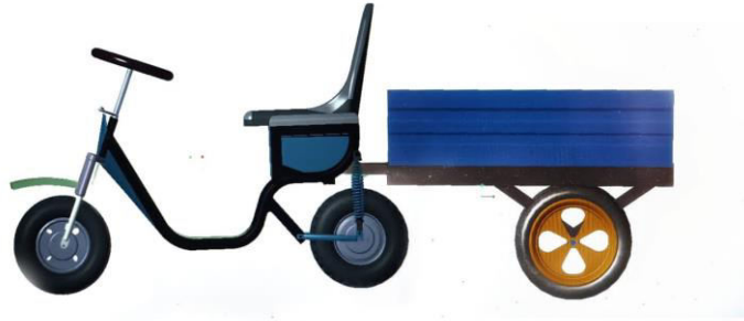
Fig. 7. Electric Cargo Vehicle

In E-Cargo vehicle fitting the hub motors to rear wheels and to connect the controller and battery the battery is placed under the driver's seat along with the charging port. The controller is fixed to the vertical bars of the chassis. The controller sends power from the battery to the Hub motor whenever the driver pushes the accelerator pedal the vehicle is move the forward direction and the controller is to be control the vehicle. This is a Manual type transmission system. The electric motor gets energy from a controller, which regulates the amount of power—based on the driver's use of an accelerator pedal. The electric car (also known as electric vehicle or EV) uses energy stored in its rechargeable batteries, which are recharged by common household electricity. Thus, an electric vehicle will have three basic components: