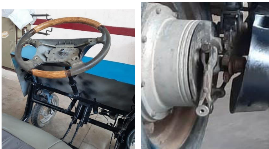
Fig. 14. Steering and Brake Mounting

6.Steering and Brake Mounting: Steering is used as it provides riding comfort. Generally, these types of steering are used in four-wheelers and trucks etc. We used drum brake which is mounted in rear wheels of the vehicle. It is an integral part of the hub motor itself. The brakes are fitted in the rear wheels of the vehicle.