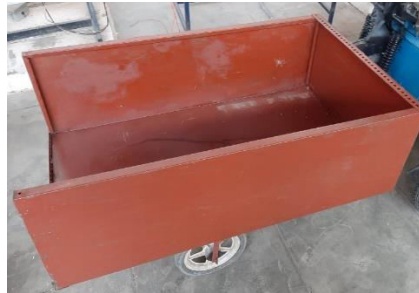
Fig. 15. Trolley

7.Trolley: The trolley frame was constructed by cutting the L-section plates of suitable size and welding them together. Later on, various cross members were welded to the trolley frame which acts as the load carrying members of the trolley. Finally, a GI sheet was placed on trolley in order to facilitate proper placement of goods.