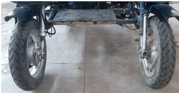
Fig. 8. Front Wheel Mounting

2.Wheel Mounting: Wheel Mounting Once the roll cage was ready both the wheels (front and rear) were mounted simultaneously to save time and distribute the work among the team member. After mounting the wheels, mounting of trolley wheels was carried out.