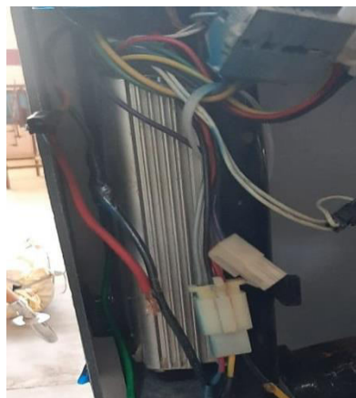
Fig. 13. Controller Mounting

5.Controller Mounting: Motor controller is a device that improves the performance of an electric motor in a pre-arranged manner. Motor controllers can include an automatic or manual means for starting/stopping the motor, choosing forward/reverse rotation, selecting and controlling the speed, modifying or limiting the torque, and shielding against faults and overloads. A controller is mounted on the sides of the vehicle in a small distance from the batteries and is connected to the throttle, battery, and hub motor.