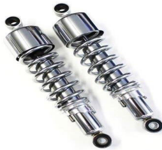
Fig. 6. Shock absorbers

8.Shock Absorbers: will go. In most dashpots, energy is converted to heat inside the viscous fluid. Shock absorber are the important part of the vehicle's suspension, which is fabricated o reduce shock impulse. Shock absorber minimizes the effect of travelling on a rough ground. Modern vehicles are designed with strong shock absorbers to tolerate any type of bouncy conditions. If supposedly shock absorber is not used then to control excessive suspension movement, stifler springs will be used. The shock absorbers duty is to absorb or dissipate energy. One design consideration. When designing or choosing a shock absorber is where that energy.