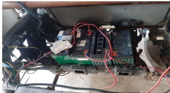
Fig. 12. Battery Mounting

5.Controller Mounting: Motor controller is a device that improves the performance of an electric motor in a pre-arranged manner. Motor controllers can include an automatic or manual means for starting/stopping the motor, choosing forward/reverse rotation, selecting and controlling the speed, modifying or limiting the torque, and shielding against faults and overloads. A controller is mounted on the sides of the vehicle in a small distance from the batteries and is connected to the throttle, battery, and hub motor.