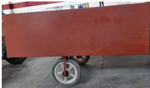
Fig. 10. Trolley Mounting

3.Hub Motor Mounting: As the hub motor is used in the vehicle so motor mounting was itself done by mounting the Rear wheels in the vehicle. The hub motors were mounted at the Rear Axle of the vehicle.