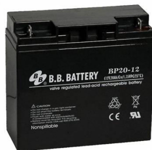
Fig. 2. Battery

3.Battery: Lead acid batteries are the most commonly used type of battery in photovoltaic systems. Although lead acid batteries have a low energy density, only moderate efficiency and high maintenance requirements, they also have a long lifetime and low costs compared to other battery types. One of the singular advantages of lead acid batteries is that they are the most commonly used form of battery for most rechargeable battery applications (for example, in starting car engines), and therefore have a well-established established, mature technology base. A lead acid battery consists of a negative electrode made of spongy or porous lead. The lead is porous to facilitate the formation and dissolution of lead. The positive electrode consists of lead oxide. Both electrodes are immersed in a electrolytic solution of sulfuric acid and water. In case the electrodes come into contact with each other through physical movement of the battery or through changes in thickness of the electrodes, an electrically insulating, but chemically permeable membrane separates the two electrodes. This membrane also prevents electrical shorting through the electrolyte.