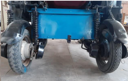
Fig. 9. Rear Wheel Mounting