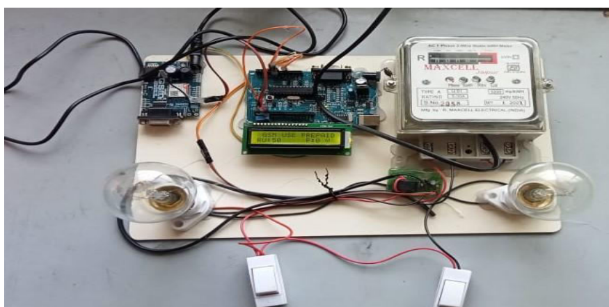
Figure 3: Hardware implementation of prepaid energy meter using GSM

An energy meter is used to measure electricity consumed by the user in domestic, industrial agriculture and many other applications. The energy is none other thing but the complete power consumed or utilized in the load center. Unit consumed or utilized by an energy meter provided in kilowatt hour. It is used in residential, commercial, and industrial purposes for measuring AC power consumed by the user. The energy meter is minimum expensive and crystal clear accurate. Microcontroller AT mega 328 is a general-purpose high-performance device with almost 32 no. of 8 bits General purpose high registers. It has on chip RAM which is briefly abbreviated as Random Access Memory and ROM which is briefly abbreviated as Read Only Memory.