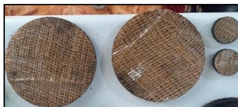
Figure 1. Jute fiber composite.

Initial sheet of jute (300X300) is cut and polyester (linkGP) resin is used. 7 sheets used for the preparation of sample and 1kg polyester resin with cobalt and hardener (1.5 % of resin quantity) as additive. Sample is kept under compression for 24 hours using compression molding machine. Prepared sample then cut ( \varnothing 100 and \varnothing 30) using laser cutting and sample having thickness of 5 mm.