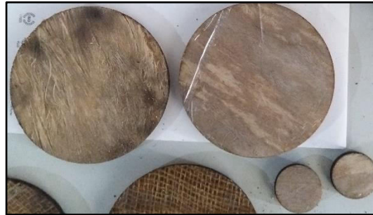
Figure 2. Cotton fiber composite.

resin is used. 2 layers used for the preparation of sample and 1kg polyester resin with cobalt and hardener (1.5 % of resin quantity) as additive. Sample is kept under compression for 24 hours using compression molding machine. Prepared sample then cut ( \varnothing 100 and \varnothing 30) using laser cutting and sample having thickness of 5 mm.