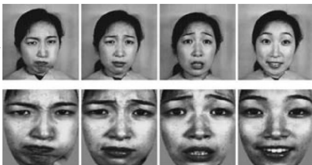
Samples from original Japanese Female Facial

Expression images before and after preprocessing.