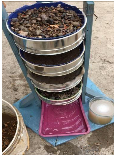
1 Fly ash treatment unit model