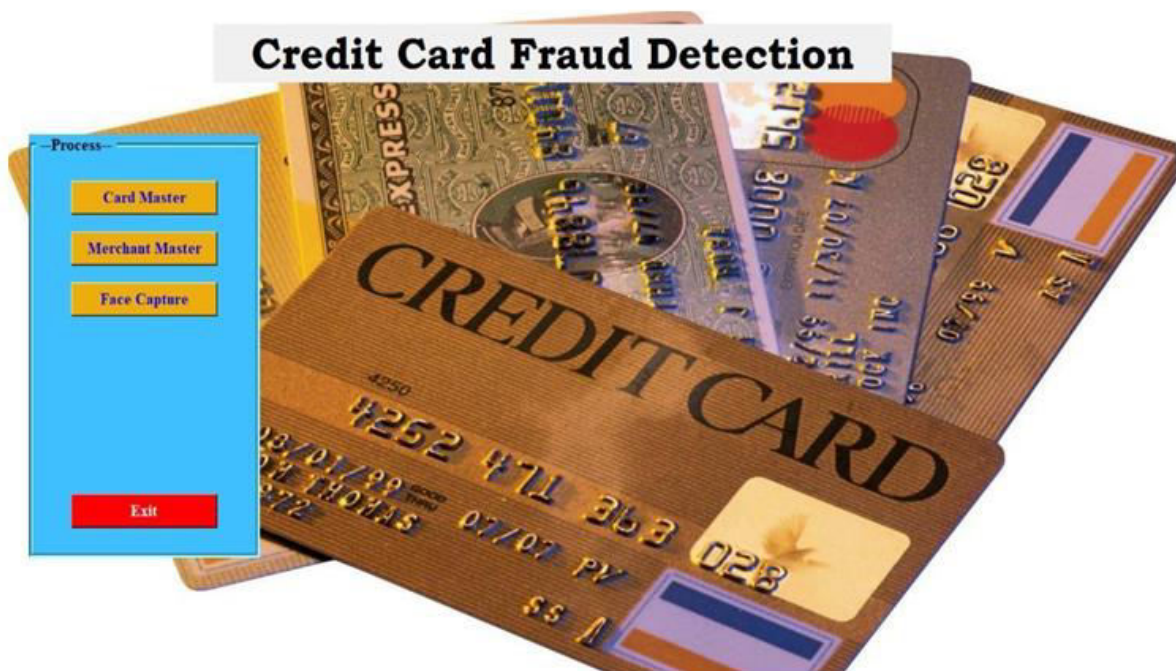
Fig.- Credit & Merchant Master, Face Capture.