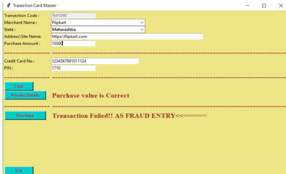
Fig.- Transaction page if Fraud Entry is detected.