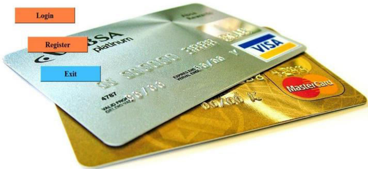
Fig.- Login Registration Page.