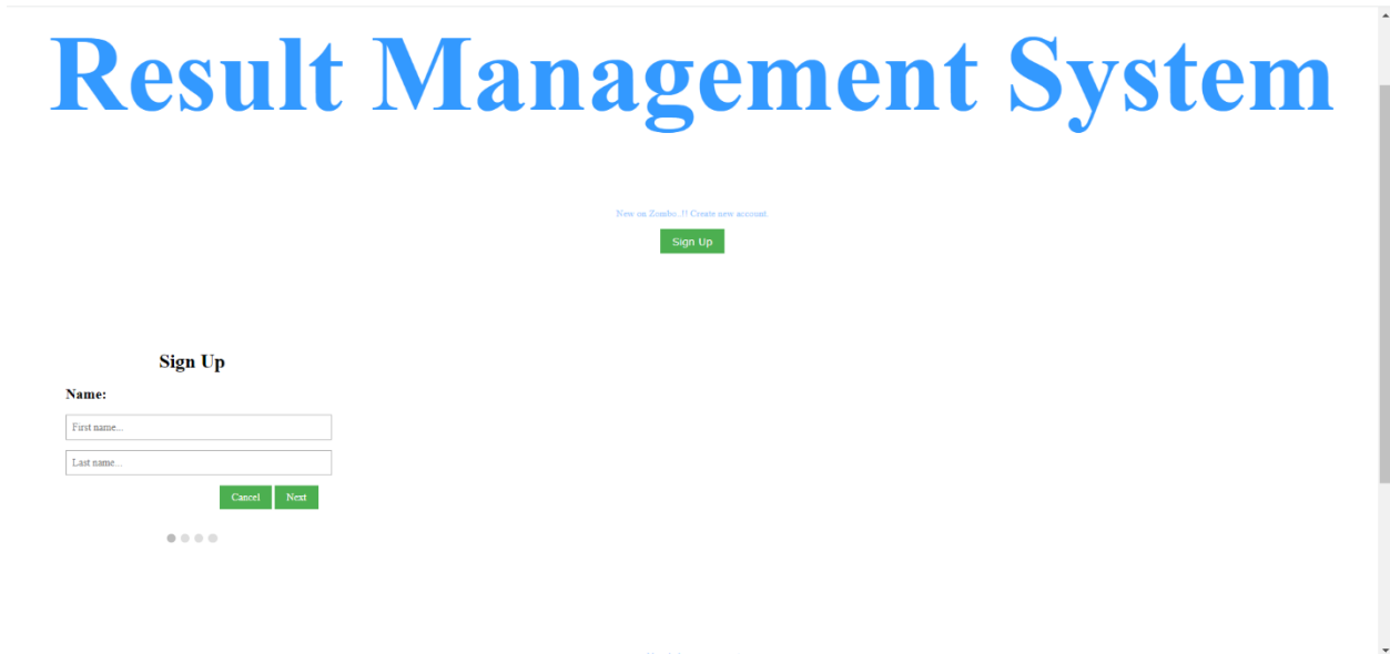
FIGURE 2 FRONT PAGE

THIS IS THE FRONT PAGE OF OUR INTERFACE OR SIGNUP PAGE