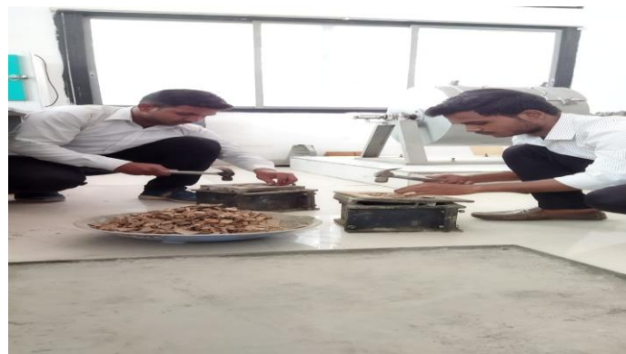
Fig no 2 - Sieving of coarse aggregate, fine aggregate, coconut shell

2. Sieving of coarse aggregate, fine aggregate, coconut shell is done.