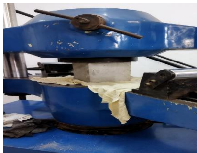
Fig no 4 - Compaction of concrete.

4. Compaction of concrete by using tamping rod in 3 layers giving 30-35 no. of blows to each layer for zero air void.