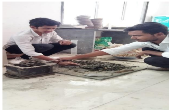
Fig no 1- Crushing of coconut shell

1. Crushing of coconut shell is done with the help of hammer.