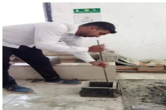
Fig no 5- Curing of cubes for 7 and 21 days.