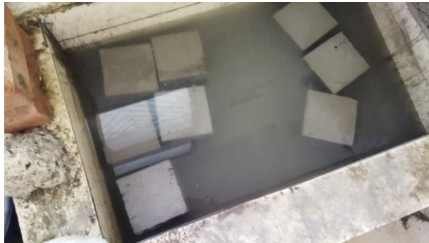
Fig no6 -Compressive testing of concrete cubes on universal testing machine after 7 and 28 days.

7. Compressive testing of concrete cubes on universal testing machine after 7 and 28 days