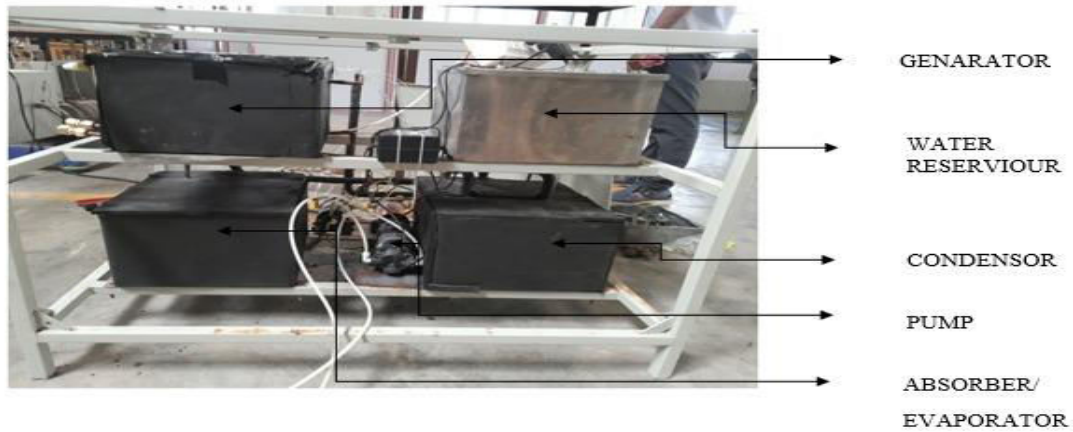
Figure 2. Photographic view of Electric vapour absorption system

The figure 2 shows the experimental setup of the electric operated vapour absorption system along with its components.