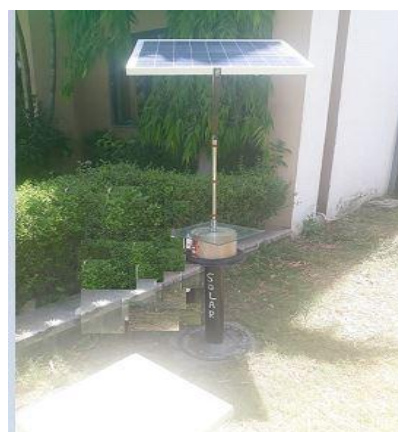
Fig -4: renewable energy based community mobile charging station

Solar powered mobile phone charging unit. The system consists of a PV module, charge controller, battery and charging ports. The energy generated by the PV module is stored in a battery. Battery is connected to the PV module through a charge controller. The charge controller acts as a maximum power extractor and a voltage regulator for the battery. A vertical pole is used to mount the PV (solar) panel and a box is designed with proper ventilation to protect the battery and controller. Fig2 shows the structural design of the system. This vertical structure can be installed for public use in public places. A universal charging port is connected to the system which has 8 ports to charge 8 mobile phone at same time.