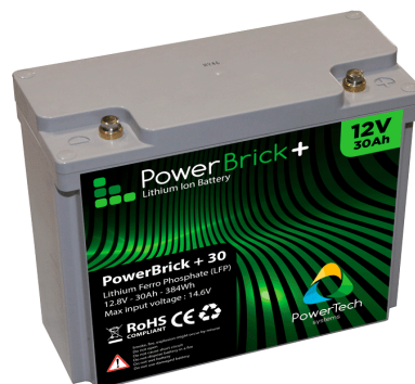
Fig -2: Lithium Battery

B) LITHIUM BATTERY:-The storage battery or secondary battery is such a battery where electrical energy can be stored as chemical energy and this chemical energy is then converted to electrical energy as and when required. The conversion of electrical energy into chemical energy by applying external electrical source is known as charging of battery. Whereas conversion of chemical energy into electrical energy for supplying the external load is known as discharging of secondary battery.