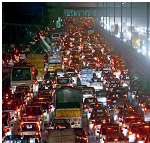
Fig no-1