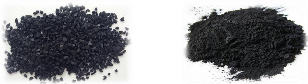
Fig 4 : -Activated Charcoal Layer