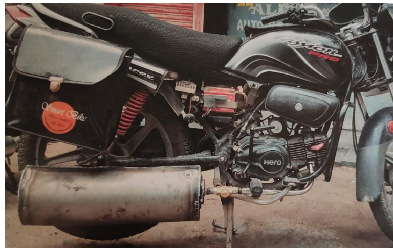
Fig 8:-Aqua Silencer Attached With Bike