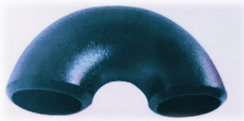
Fig 3: - U-bend

The U Bend is given rather than a non-return valve which is a mechanical gadget, which regularly permits liquid (fluid or gas) to move through it in only one heading. The water silencer was loaded up with water and it is straightforwardly associated with the fumes line of the motor. There is an opportunity for the water to get go into the motor chamber. To stay away from this, U twist is utilized.