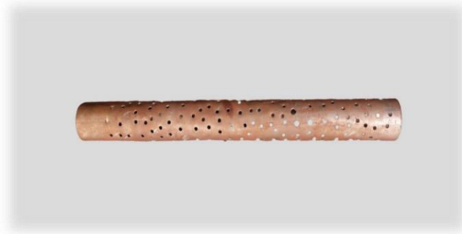
Fig 2:- Perforated Tube