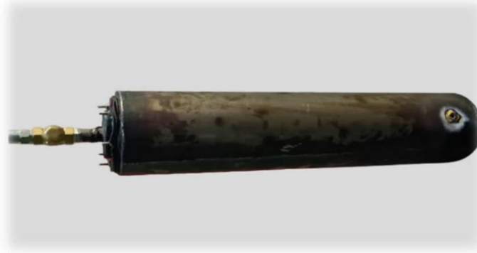
Fig 5 :- Outer Shell

The entire arrangement was kept inside the external shell. It is comprised of iron or steel. The water delta, outlet and exhaust tube were given in the actual shell.