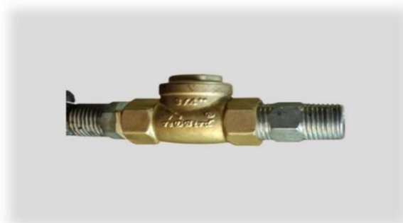
Fig 7: -Non-Return Valve

A non-return valve permits a medium to stream in just a single heading and is fitted to guarantee that the medium courses through a line in the correct bearing, where tension circumstances may somehow or another reason turned around stream. The move through the non - return valve causes a somewhat enormous strain drop, which must be considered while planning the framework.