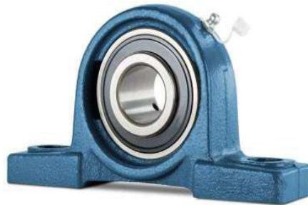
Fig.-3: Pillow Block Bearing