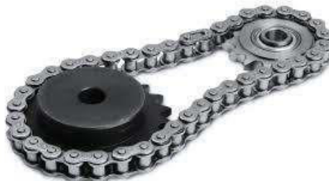
Fig.-8: Chain Sprocket

A sprocket, sprocket-wheel or chain wheel as shown in fig.-8 is a profiled wheel with teeth that mesh with a chain; track or other perforated or indented material. The name 'sprocket' applies generally to any wheel upon which radial projections engage a chain passing over it.