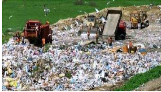
Fig.-1: Domestic and Industrial Garbage Collected in Garbage Collection Area