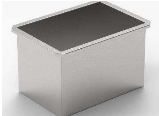
Fig.-6: Garbage Collecting Tank