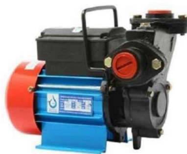
Fig.-5: Electric Motor

In order to drive the chain sprocket mechanism an electric motor is required. An electric motor as shown in fig.-5 is an electrical device which produces rotary mechanical energy by using input electric energy. An electric motor is selected to ensure continuous rotation of the chain sprocket mechanism.