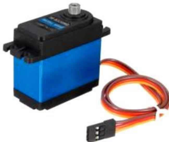
Fig. 4 Servo motor

A servomotor is a rotary actuator or linear actuator that allows for precise control of angular or linear position, velocity and acceleration. It consists of a suitable motor coupled to a sensor for position feedback. Servomotors are used in applications such as robotics, CNC machinery or automated manufacturing. A servomotor is a closed-loop servomechanism that uses position feedback to control its motion and final position. The input to its control is a signal (either analogue or digital) representing the position commanded for the output shaft.