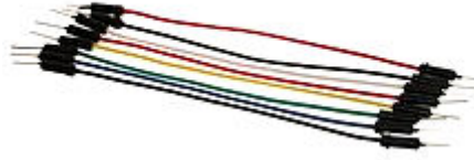
Fig. 6 Jumper wire

Individual jump wires are fitted by inserting their "end connectors" into the slots provided in a breadboard, the header connector of a circuit board, or a piece of test equipment.