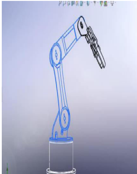
Fig. 1 Design