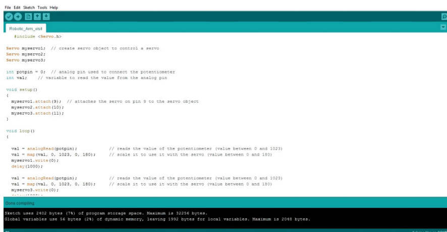
Fig. 7 Arduino Interface

Programming of the Pick and place Robot is to be done using a suitable Programming Language. The Robot is to be interfaced with the computer by the programmed software, which will guide the robot to do its job for which it is been programmed. There are numbers of various programming languages available now a day in the market, so the appropriate programming language is to be selected for the programming purpose and the programming is to be done.