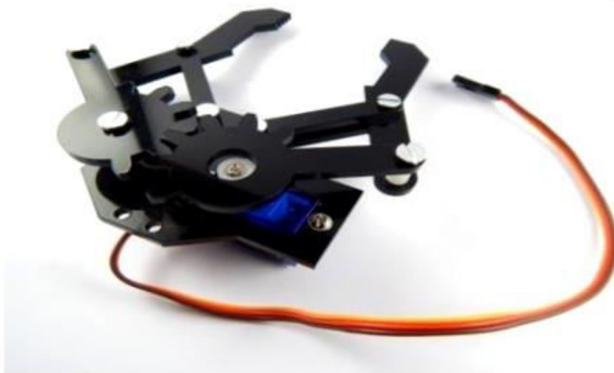
Fig. 5 Mechanical Gripper

A mechanical gripper is used to grip the objects and hold it while transferring it from its location to the destination. The gripper has its inbuilt mini servo in it so it can open or close its jaws to grip the objects. The gripper is made from the acrylic by the LASER cutting operation .the shaft of the servo is fixed to the end of first jaw which meshes with the gear on the second jaw. As the motor rotates the gear rotates and this in turn rotates the gear in mesh and the jaws open or close to release or holds the objects. A gear link is attached to a servomotor which is meshes with another geared link to provide a smooth action of gripping of different objects according to their sizes the movement of both of figures of the grippers is synchronize well to hold the object.