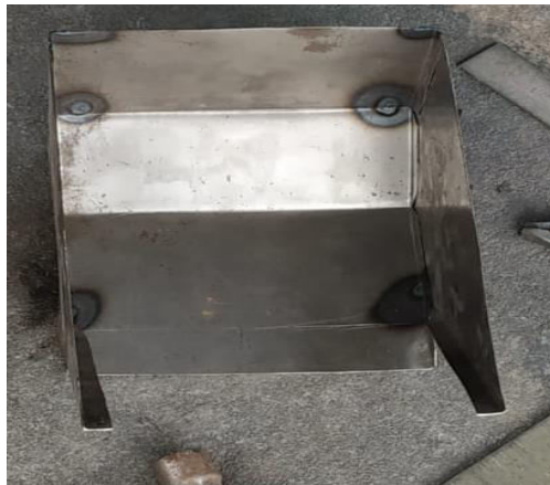
Fig 7: Seed storage tank

Capacity gadget is one of the significant gadgets of the framework. This part is fixed. To the lower part of this tank seed planting circle is organized. This circle serves the capacity of conveyance of the seeds, with respect to each finish revolution of the pivoting wheel, just a single seed tumbles from the tank. Likewise, number of seeds tumbling from tank is shifted by necessities. This circle uniformly opens the method for cultivating thus planting is done without a hitch and precisely.