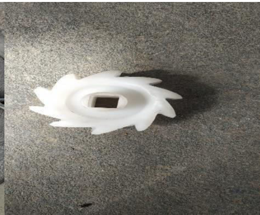
Fig 8: Seed wheel