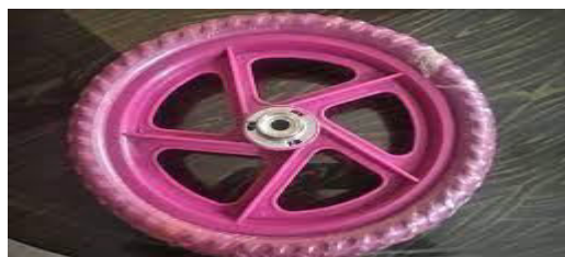
Fig2: Wheel Chain

Wheels play a major role for the movement from one place to another without it we can't move.