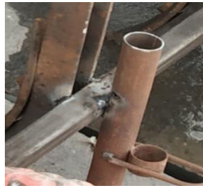
Fig 6: Nozzle