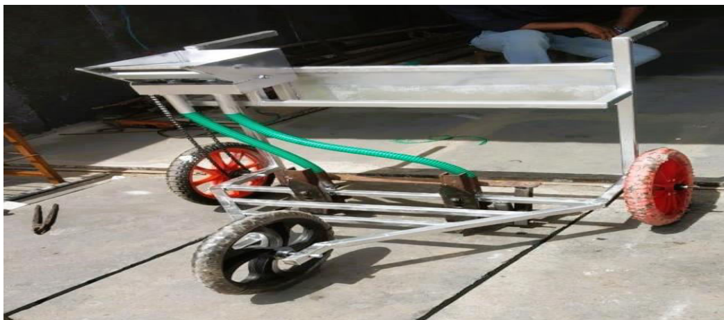
Fig 9: Working of Seed Sowing Machine