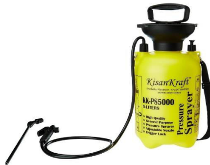
Fig 6 : Pressure tank

Sprayers are fully integrated, mechanical systems, meaning they are composed of various parts and components that work together to achieve the desired effect, in this case: the projection of the spray fluid. This can be as simple as a hand sprayer attached to a bottle that is pumped and primed by a spring-lever, tube, and vacuum-pressure; or as complex as a 150 foot reach boom sprayer with a list of system components that work together to deliver the spray fluid.