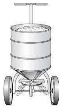
Fig 1: Urea Spreader Machine Model

Percentage reduction in time required for Fertilization was observed to be 50% and reduction in labor cost as compared to conventional method was 80%. It has solved the problem of traditional way of Fertilization.