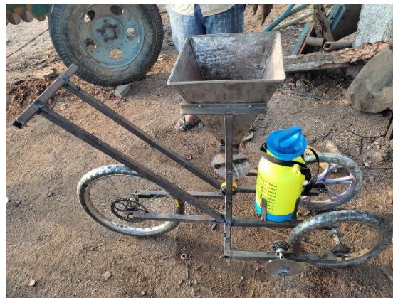
Fig 2 : Frame

The back side of the vehicle is placed a pesticide sprayer which is automatically operated by the rear wheels. The rotary motion of the rear wheels is converted into reciprocated motion which is helps to increase the pressure in the pesticide sprayer. The piston of the pesticide sprayer is connected to the reciprocating motion due to this the pressure in the sprayer increases and sprayer the liquid out with high pressure.