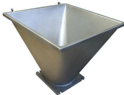
Fig 3 : Hopper

A hopper is a large, pyramidal or cone shaped container used in industrial processes to hold particulate matter or flowable material of any sort (like dust, gravel, nuts or seeds) and dispense these from the bottom when needed. In some specialized applications even small metal or plastic assembly components can be loaded and dispensed by small hopper systems. In the case of dust collection hoppers the dust can be collected from expelled air. Hoppers for dust collection are often installed in groups to allow for a greater collection quantity. Hoppers are used in many industries to hold material until it is needed, such as flour, sugar or nuts for food manufacturing, food pellets for livestock, crushed ores for refining, etc. Dust hoppers are employed in industrial processes that use air pollution control devices such as dust collectors, electrostatic precipitators, and baghouses/fabric filters. Most hoppers are made of steel.