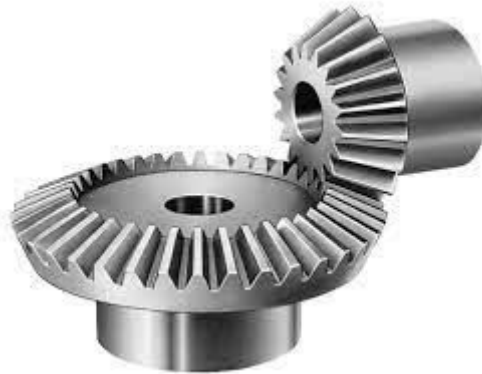
Fig5 : Bevel Gear

Two important concepts in gearing are pitch surface and pitch angle. The pitch surface of a gear is the imaginary toothless surface that you would have by averaging out the peaks and valleys of the individual teeth. The pitch surface of an ordinary gear is the shape of a cylinder. The pitch angle of a gear is the angle between the face of the pitch surface and the axis.