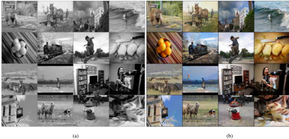
Fig. 2. Gray Scale images to colored images (a) Original grayscale image (b) Colored Images

better in terms of visual quality than those produced by the baseline CNN. The colors in the photographs created by GAN were more bright, but the results from CNN had a light tone. The GAN was able to nearly recreate the ground truth in some circumstances. One disadvantage was that the GAN tended to colorize objects in the colors that were most frequently encountered.