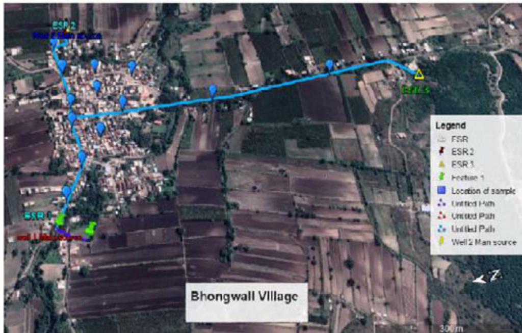
Fig. Bhongwall Village