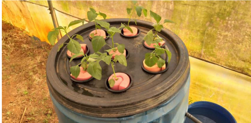
Fig 3. The developed aeroponic system and plants