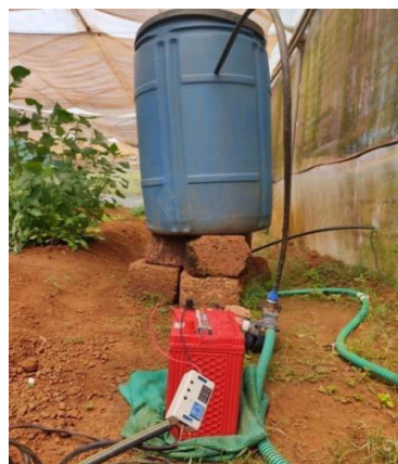
. Fig 2. Developed aeroponic system for study

The growth parameters of amaranthus used for vegetable purpose obtained from market were studied. The root length is an important parameter in aeroponics. Based on this parameter the total height of tank and distance of lateral from top of tank was decided. The maximum root length was found to be 13 cm. Maximum height of amaranthus vegetable was measured to be 59 cm while minimum was obtained as 37.8 cm. The maximum and minimum spread diameter was obtained as 20.1 and 10.4 cm respectively while the stem diameter were found to be 6.06 mm as maximum and 2.12 mm as minimum. It was considered as 20 cm considering maximum growth of plants under aeroponic technique. The spread of 20 cm is considered for the growth of plants. This gave plant to plant distance of 20 cm in the developed structure. The maximum root diameter of 6 mm is considered as the hole of 6 mm diameter was drilled in the plastic growing bowl of the growing plants. The developed aeroponic system for the study is shown in Fig.2. The plants grown under developed system is shown in Fig 3. The amaranthus plants earlier grown in the plastic tray in the media of coco peat and vermicompost of age 10 days were transplanted into aeroponic system.