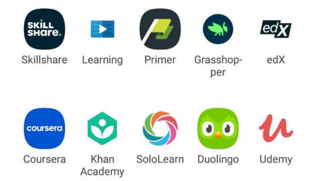
Fig 2.The mobile icons of the list of m-learning apps used in the study

The review process started with the selection of the m-learning applications that were to be analyzed. The top ten most popular applications worldwide were chosen from Google Playstore. They are Skillshare, LinkedIn Learning, Primer, Grasshopper, edX, Coursera, Khan Academy, SoloLearn, Duolingo, and Udemy.