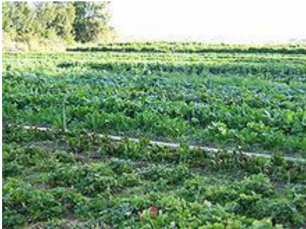
Organic cultivation of mixed vegetables in Capay, California

"Organic agriculture is a production system that sustains the health of soils, ecosystems and people. It relies on ecological processes, biodiversity and cycles adapted to local conditions, rather than the use of inputs with adverse effects. Organic agriculture combines tradition, innovation and science to benefit the shared environment and promote fair relationships and a good quality of life for all involved..."