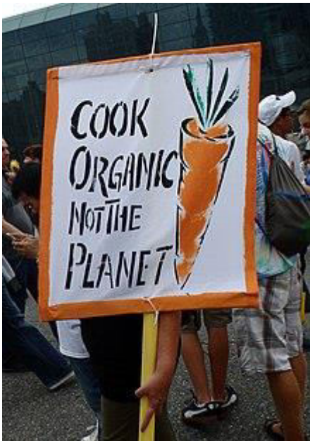
Placard advocating organic food rather than global warming

Organic farming relies more heavily on the natural breakdown of organic matter than the average conventional farm, using techniques like green manure and composting, to replace nutrients taken from the soil by previous crops. This biological process, driven by microorganisms such as mycorrhiza and earthworms, releases nutrients available to plants throughout the growing season. Farmers use a variety of methods to improve soil fertility, including crop rotation, cover cropping, reduced tillage, and application of compost. By reducing fuel-intensive tillage, less soil organic matter is lost to the atmosphere. This has an added benefit of carbon sequestration, which reduces greenhouse gases and helps reverse climate change. Reducing tillage may also improve soil structure and reduce the potential for soil erosion.