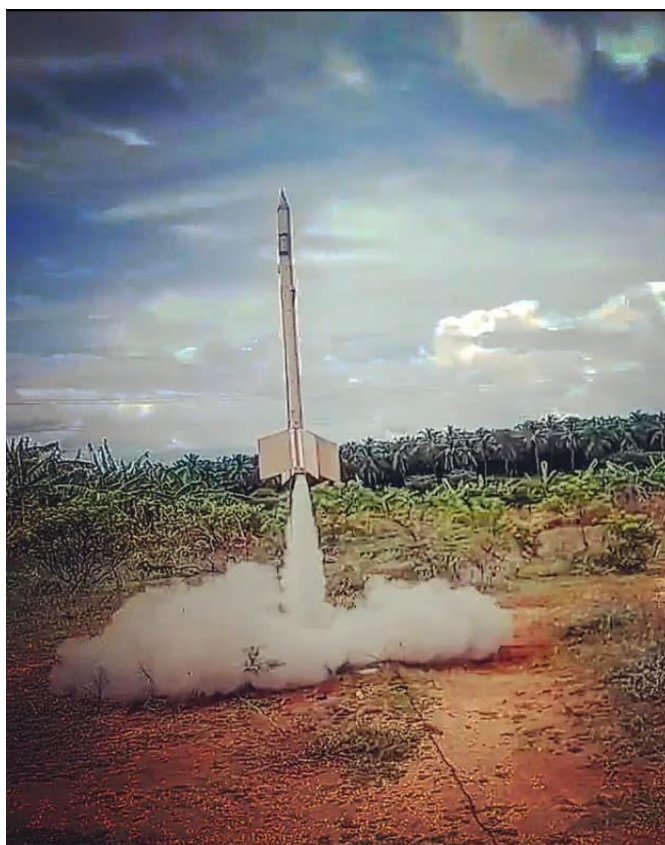
Figure 4 Propulsion of rocket

The thrust equation given above works for both liquid and solid rocket engines. There is also an efficiency parameter called the specific impulse which works for both types of rockets and greatly simplifies the performance analysis for rocket engines.