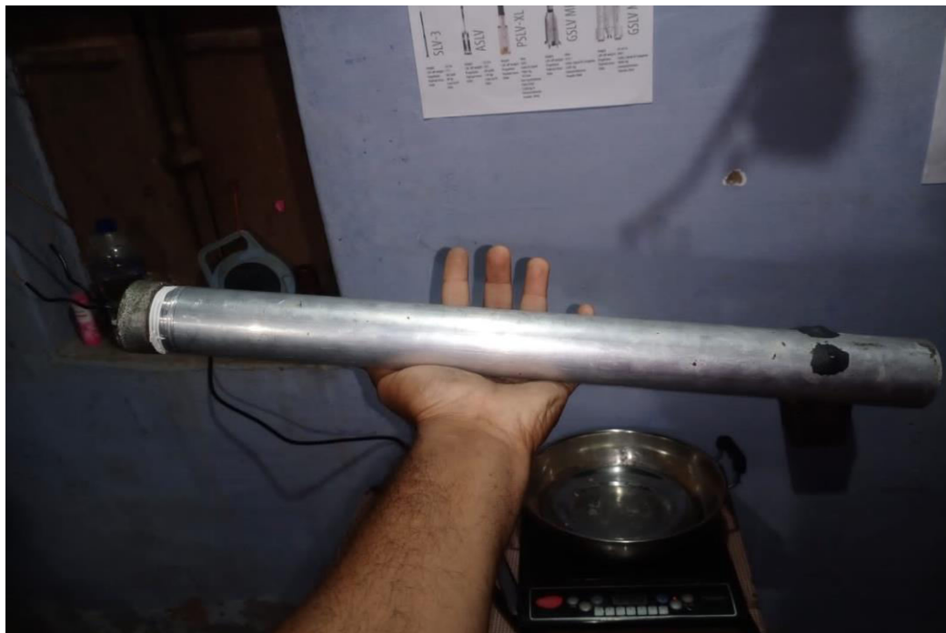
FIGURE 2 FUEL MOTOR BODY