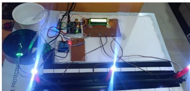
Figure 3: Prototype of the Proposed System

Data can be used by a system called Adafruit IO. Our emphasis is on simplicity and enabling straightforward data transfers with minimal coding needed. Client libraries for our REST and MQTT APIs are included with IO. Ruby on Rails and Node.js are the foundations of IO. IO by Adafruit is presently in beta. You can sign up for the beta at io.adafruit.com if you'd want to participate.