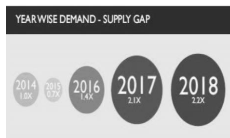
Fig. 1 Year-wise demand-supply gap projected

In Censes of 2011, the country had a blasting population of 1,211.96 million, among that 378.11 million (Approx. 31.15 %) stayed in Urban Areas. In last decade 2001-2011, the urban Indian population exploded at a compound annual rate-growth of 2.9%, resulted within the compounded enhanced level of urbanization from 27.81% to 31.15% and still increasing until date. This speedily growing population of individuals in Urban-Areas has led to the difficult downside in housing deficit, land scarcity, and engorged roads & has additionally many issues of the present basic amenities like electricity, water and green areas of the cities and city. The projected demand is given below.