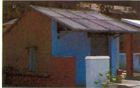
Fig 4.1. Mud Plastered House