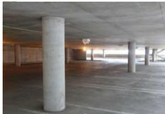
Fig 4.2 Flat Slab

Slab is one such component of house that is directly supported on columns without any intermediate beams as shown in figure 3. It was constructed in 1906 by Turner in USA by using some of the basic theoretical designs. Testing of different slabs was done during 1910- 1920. But Nicholas in 1914 gave a basic design method for its construction, but Jacob S Grossman's method of equivalent frame method with equivalent beam had been preferred by many engineers.