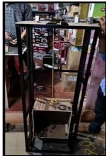
Fig.5.1.Construction of Elevator

The construction of the working mode is starts with the frame/body pf the working model. With the help of a steel framework, the elevator is built a steel framework to retain longevity and strength of the elevator. Body holds and contain almost all the other components of the working model so that design of the working model so that it can sustain various stresses and vibration that exerted during the working of the model. After the construction of the body the next part is the working mechanism; Working mechanism should be in height and distance so that it not come in the way of the worker who going to work on this model; The elevator can be constructed with various elevator components or elevator parts that mainly include speed controlling system, electric DC motor, rail, cabin, doors and PLC unit.