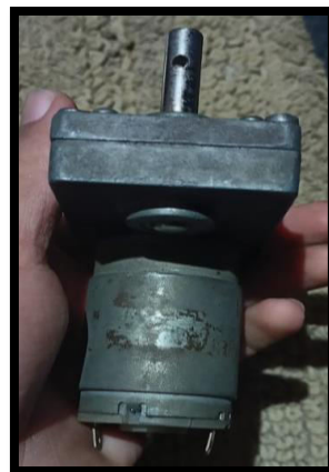
Fig.No.4.2 DC Motor

A geared motor is a component whose mechanism adjusts the speed of the motor, leading them to operate at a certain speed. geared motor have the ability to deliver high torque at low speeds, as the gearhead functions as a torque multiplier and can allow small motors to generate higher speeds.