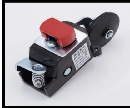
Fig.No.4.1 Limit Switch