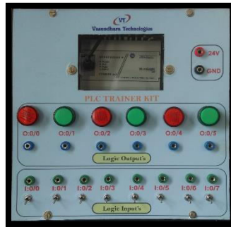
Fig.4.3. PLC Trainer kit

The PLC is basically computer-based so, their architecture is very parallel to computer architecture. The memory contains operating system stored in fixed memory like ROM. The application program is stored in read-write memory. Central processing unit (CPU) presents in each and every programmable controllers, power supply, memory, input/output (I/O) modules and programming devises. The operating system is the heart of the system.