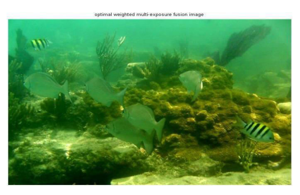
Fig 7.5 Optimal weighted multi-exposure fusion