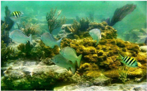
Fig 7.6 Proposed Enhanced Output Image