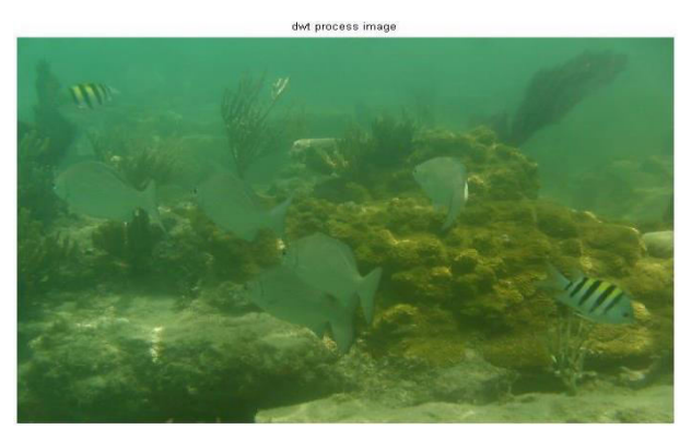
Fig 7.4 DWT Process Image

DWT provides a simultaneous spatial and frequency domain information of the image