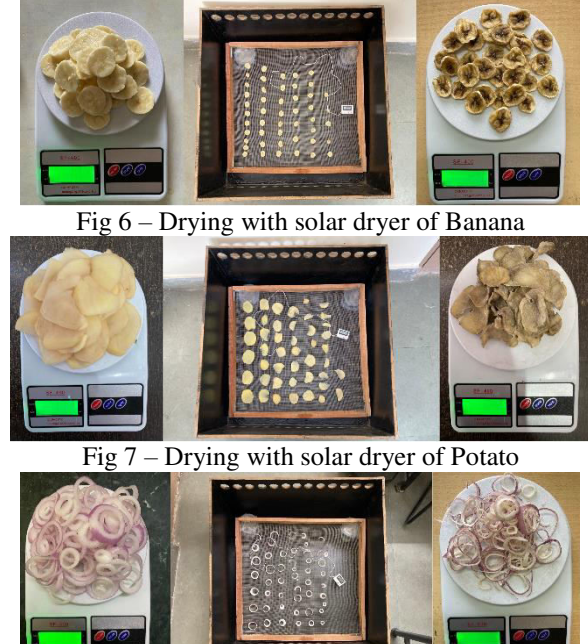
Fig 8 – Drying with solar dryer of Onion

Drying using solar dryer : Food products are sliced into the form of chips and initially weighed. These chips are then put into the drying chamber of the solar dryer. After all the moisture has been removed, the chips are weighed again and time required is noted.