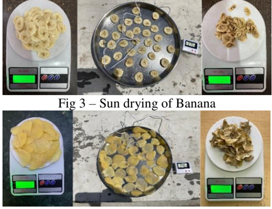
Fig 4 – Sun drying of Potato

Conventional sun drying : Food products are sliced into the form of chips and initially weighed. These chips are then put into direct sunlight on a plate. After all the moisture has been removed, the chips are weighed again and time required is noted.