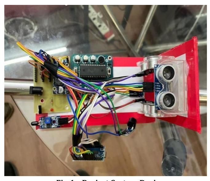
Fig:1 - Project System Design

Our project initially includes a stick and the sensors that are attached to it which a blind person carries inside thehouse with him when he needs to move. The proposed system consists of Ultrasonic sensors which useultrasonic waves to find obstacles along with fire sensors which detect fire. While identifying obstacles like steps, fire, walls etc. The data from the sensor is sent to the Arduino UNO. After analysing the information, the Arduino UNO determines if the barriers are close enough.