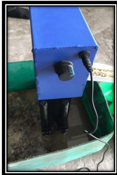
Fig 2.4 FINAL PROJECT