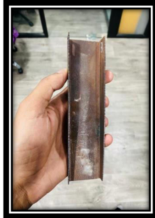
Fig 2.3 SCARPER PLATE

A Scraper Plate is made from MS Plate 1mm Thickness. It is made from Laser Cutting, Bending can be done.