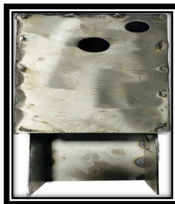
Fig 2.2 CASING

A Frame made from MS Plate 1mm Thickness. It is made from Laser Cutting, Welding can be done.