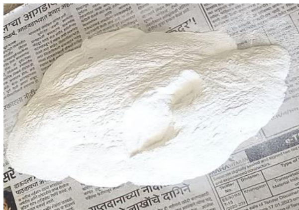
a. Eggshell Powder (ESP)

Step 6- The eggshell powder was sieve through 90 micron sieve. Finally, a fine eggshell powder is obtained.