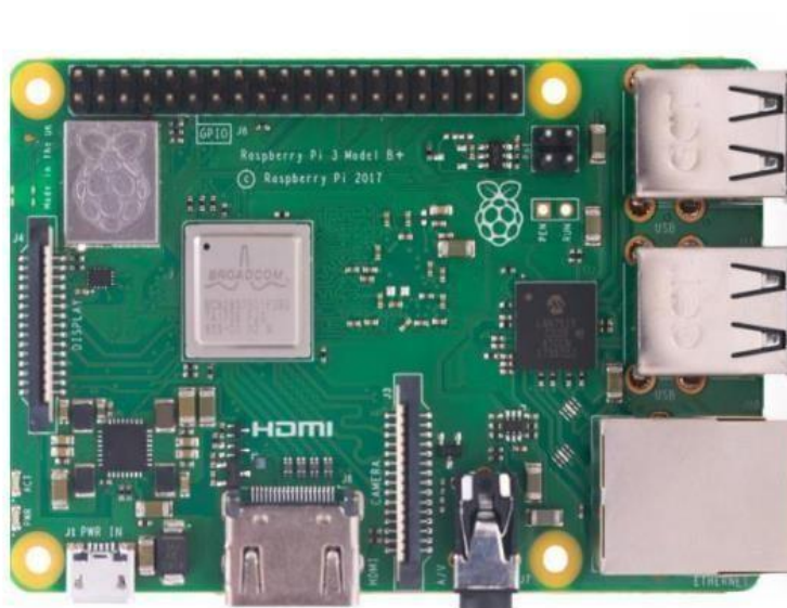
Fig 3:Raspberry Pi Model 3 B++

The Raspberry Pi 3 is a versatile device that can be used for various purposes such as education, coding, and building hardware projects. In this project, the Raspberry Pi 3 is the main component that is used as a low-cost embedded system to control and connect all of the components together. It can run various operating systems such as Raspbian or NOOBs and can accomplish many important tasks. However, for this particular project, the team has decided to work on Raspbian as the operating system.