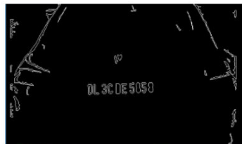
5. Edge detection