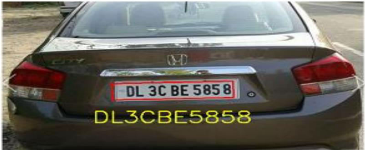
16. Printing the plate number.