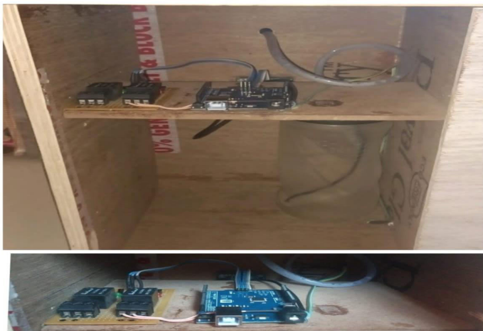
Figure3. Inner Design Of Hand sanitizer

We have designed an automatic hand sanitizer system. When one moves one’s hand close to the Ultra sonic sensor, the hand sanitizer container is Spray once. Show actual images of the proposed device.