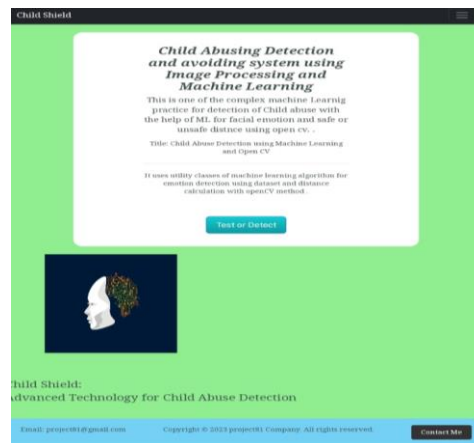
Fig. b Website Landing Page

In Fig. b we see a website which get live feed from camera and checks activity live using image processing and if any activity detects it gives alert using buzzer or sends the message.