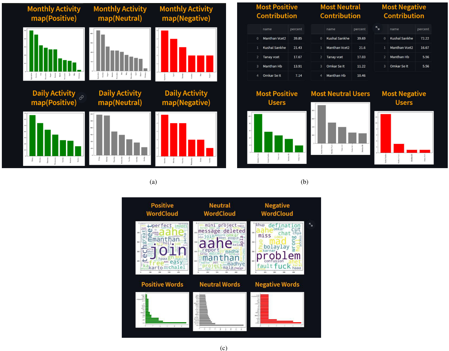
Fig.3. Visualizing Data x(a) Monthly and daily activity maps (b) most positive, negative and neutral members contribution (c) Word cloud showing frequently used words

Furthermore, because the mood of a chat might change depending on the subject, the participants, and the cultural and sociological elements that affect their behaviour, the rule-based algorithm utilised in this investigation may not be generalizable to different WhatsApp chats or circumstances.