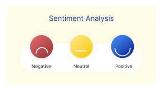
Fig 2. Sentiment Analysis

Natural language processing (NLP) is a subfield of linguistics, computer science, and artificial intelligence concerned with the interactions between computers and human language, in particular how to program computers to process and analyse large amounts of natural language data. The goal is a computer capable of "understanding" the contents of documents, including the contextual nuances of the language within them. The technology can then accurately extract information and insights contained in the documents as well as categorize and organize the documents themselves.[5]