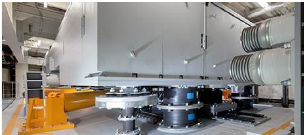
Figure 4: Tuned Mass Damper

Tuned mass dampers are devices that are designed to counteract the movement of a building during an earthquake. These devices consist of a heavy mass that is suspended within the building and connected to a damper system. The mass and damper are tuned to the building's natural frequency, allowing them to counteract the building's movement during a seismic event.