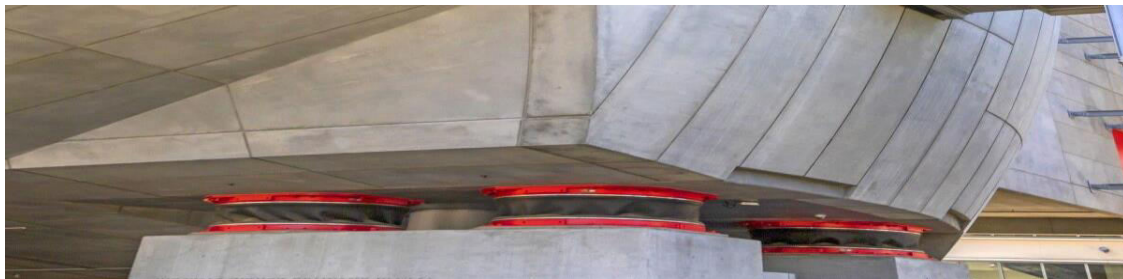
Figure 2: Base isolators

Base isolation is a technique used to separate a building or structure from the ground by placing it on a system of flexible bearings or pads. This technique can reduce the amount of seismic energy that is transmitted to the building, thereby reducing the risk of damage and collapse. In Japan, base isolation is a common technique used in the construction of high-rise buildings, bridges, and other critical infrastructure.