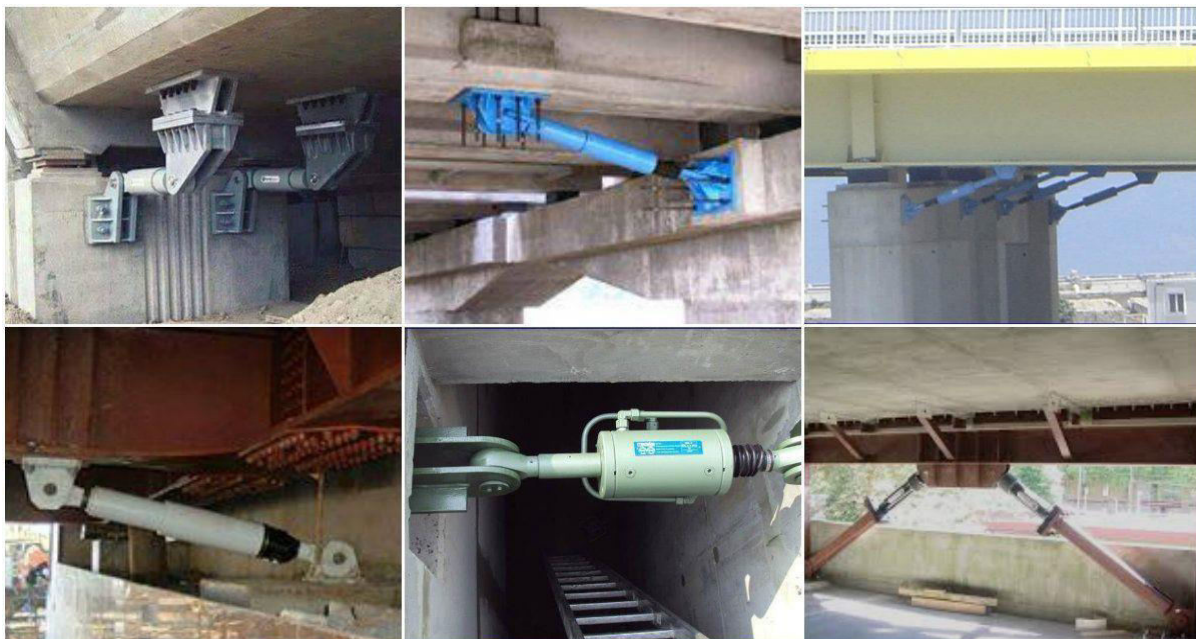
Figure 3: Dampers

Dampers are devices that are designed to absorb and dissipate seismic energy, reducing the amount of force that is transferred to the building structure. There are several types of dampers used in earthquake-resistant design, including viscous dampers, friction dampers, and tuned mass dampers. In Japan, dampers are often used in conjunction with base isolation to further enhance the building's seismic resistance.