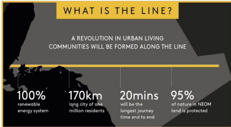
Fig. No. 3 Some of its distinctive characteristics (Neom, 2021)

The text discusses a new city concept called "The Line" that is being developed in Saudi Arabia. The city will be pedestrian-friendly with no cars, roads, or carbon emissions, and will be powered by renewable energy sources such as wind and solar power. The city will have multiple sectors including residential, commercial, and industrial with a focus on sustainable industries such as renewable energy, biotechnology, and advanced manufacturing. The project is part of Saudi Arabia's Vision 2030 plan, which aims to diversify the country's economy and reduce its dependence on oil.