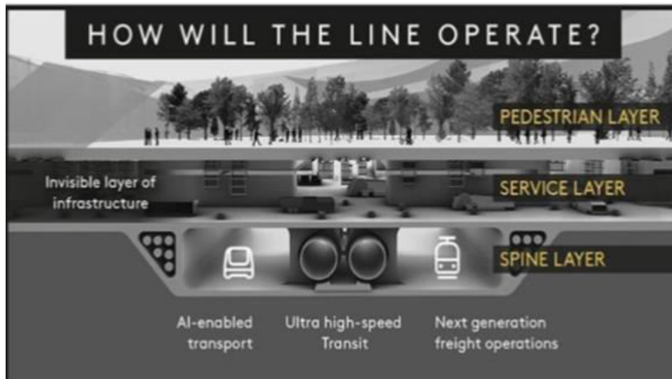
Fig. No. 2 Layers of The Line.

The area where the NEOM project will be executed offers optimal conditions for the generation of electricity from renewable sources such as solar and wind energy. Management of NEOM projects must be implemented with the resources that are easily available in today's environment. Overall, the NEOM project represents a vision of a sustainable and innovative future for Saudi Arabia and the world