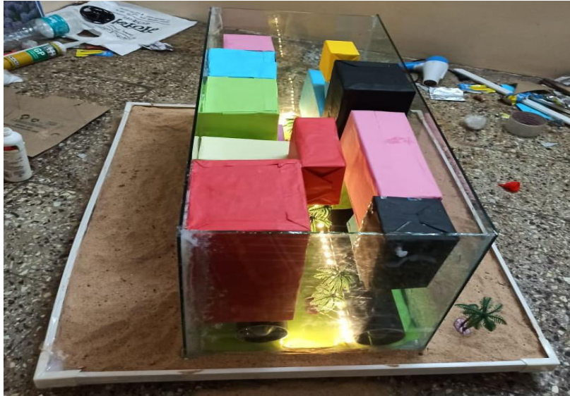
Fig. No. 4 Prototype Model of The Line City