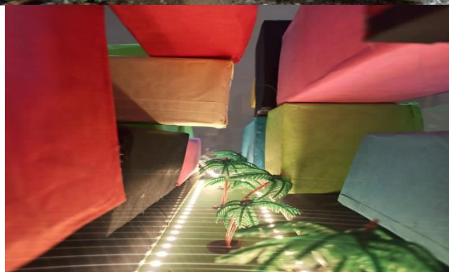
Fig. No. 5 For Showing Internal Amenities of The Line City.