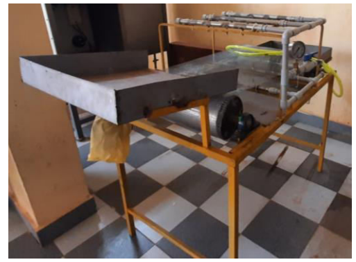
Fig.2 working model

The 42\times24\times28 inch (L×W×H) steel square tube and L angle frame is constructed of. which support the other washing machine components. the conveyor that transports fruits and vegetables from the hopper to the collection chamber. The conveyor made with steel mesh. The instrument used to measure pressure, the pressure gauge. The water droplets were sprayed using nozzles with a 1mm diameter. These nozzles are situated in the middle and above the conveyor. As a result, the conveyor rotates slowly thanks to the geared motor, which has a 60 rpm speed. This machine is mostly used to wash produce before it is sold.