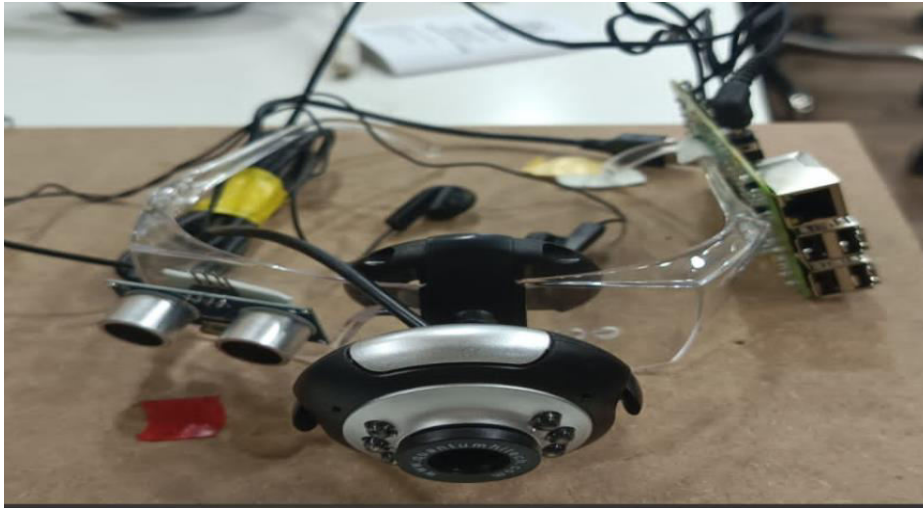
Figure 4.1 Working model